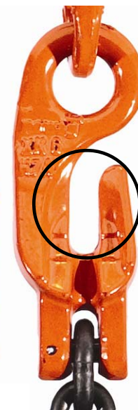
Integrated shortening hook design is completely adjustable and eliminates improper choke, wrapping or knotting of chain