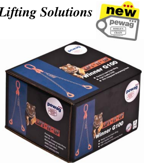
Attractive retail packaging maximizes POP Sales