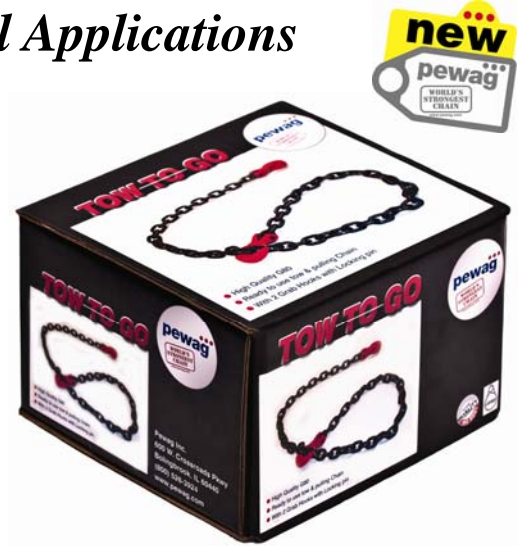
Attractive retail packaging maximizes POP Sales