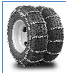
Available in duals