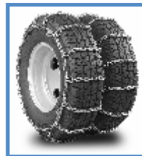
Available in duals