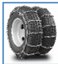
Available in duals