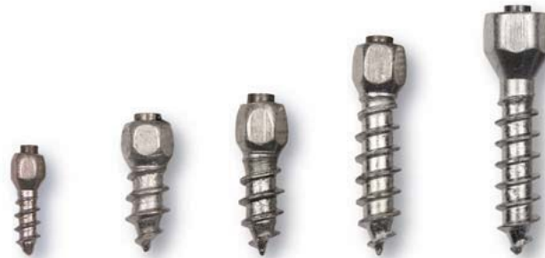
HM-11 HM-15 HM-18 HM-25 HM-30

: details : : details : : details : : details : : details :